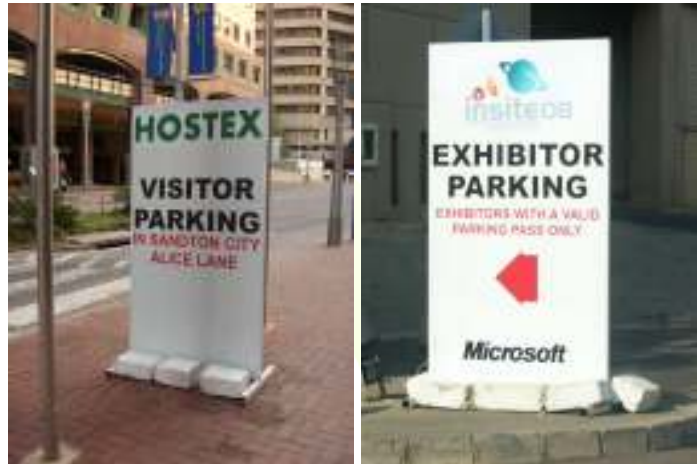
Large clearly visible signs lead the way to exhibitor loading bay access and visitor parking areas.