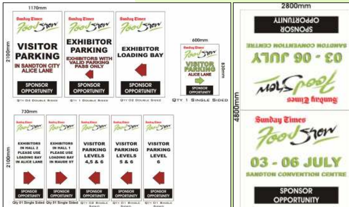
Full complement of parking signs and Sandton roadside banner wrap