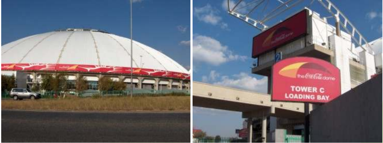
We re-branded the entire Northgate Dome complex for Coca Cola

We print, manufacture and erect large format, durable, UV resistant outdoor signage. We use the highest quality inks and materials which stand up to stringent color requirements (such as Coca Cola red) and do not fade in the hot African sun.