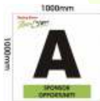
Hanging Aisle Signs