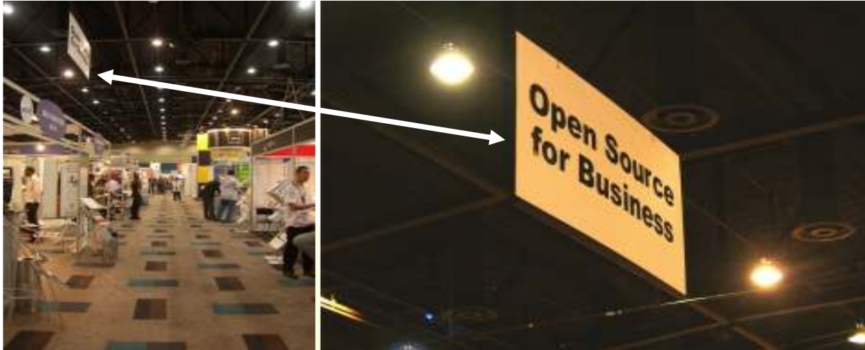
Aisle signs suspended from the ceiling are clearly visible throughout the venue to guide visitors to specific areas of the exhibition.