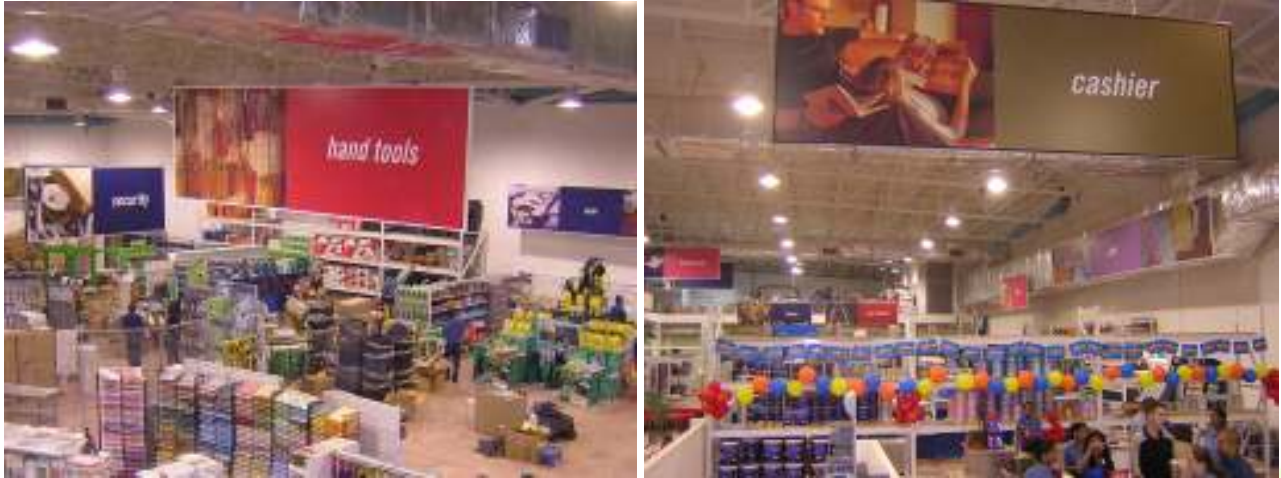
Hanging banners in the foreground with wall-mount banners in the background

We print, manufacture and install large format hanging and wall-mounted banners.