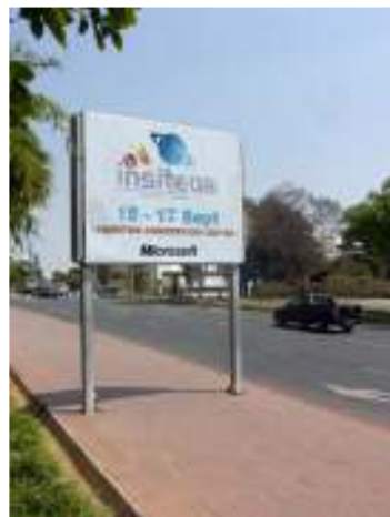
Banner wraps can be used on existing street signage to temporarily advertise your event (with municipal permission of course!).