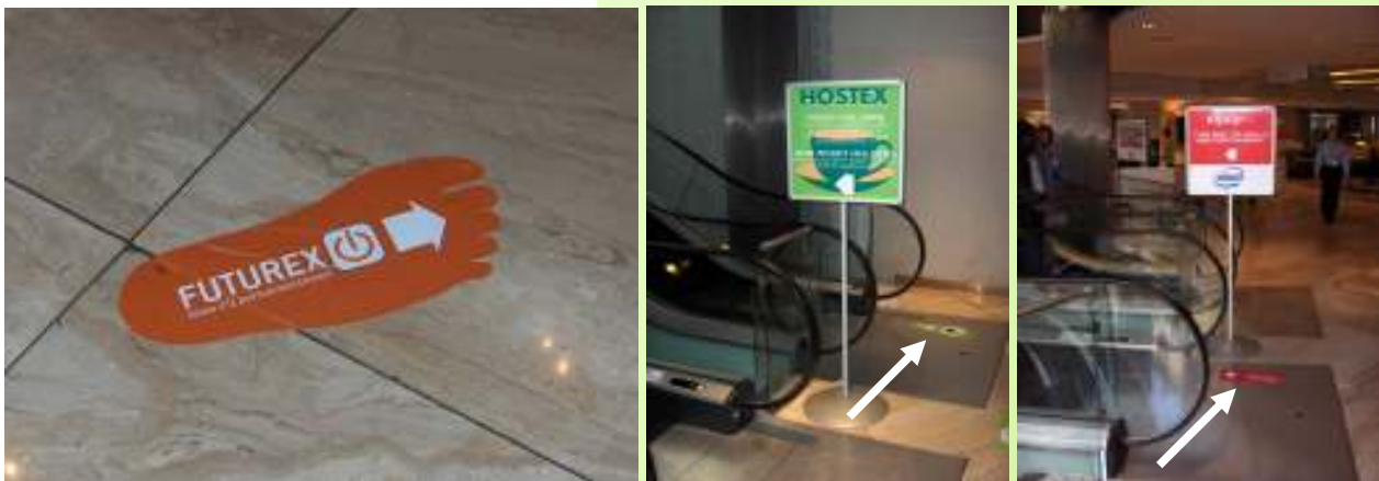
Tracks of branded footprints show visitors the way between exhibition halls and to key locations within the exhibition.