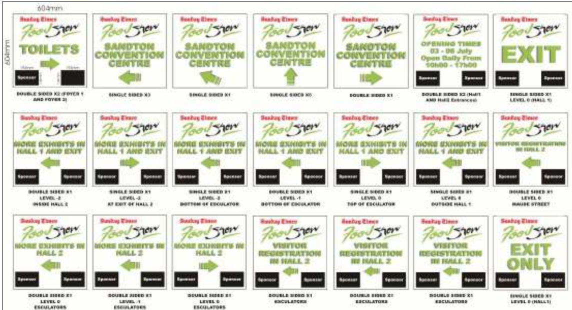
Full complement of directional lollypop signs