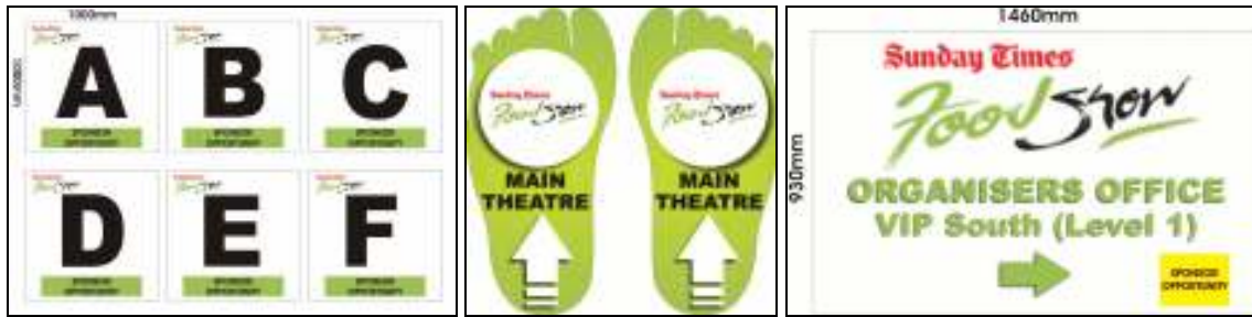
Aisle signs, footprints and freestanding sign