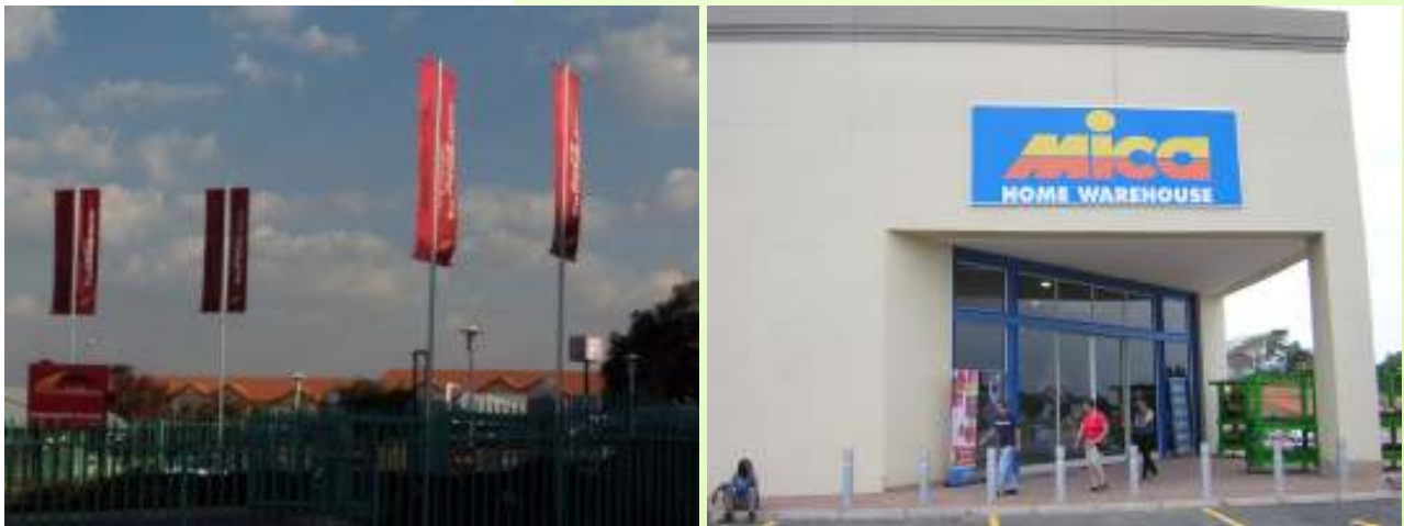
Outdoor banners (left) and external signage (right)

We print, manufacture and erect outdoor banners that are vibrant, durable and resistant to wind, weather and the Sun.